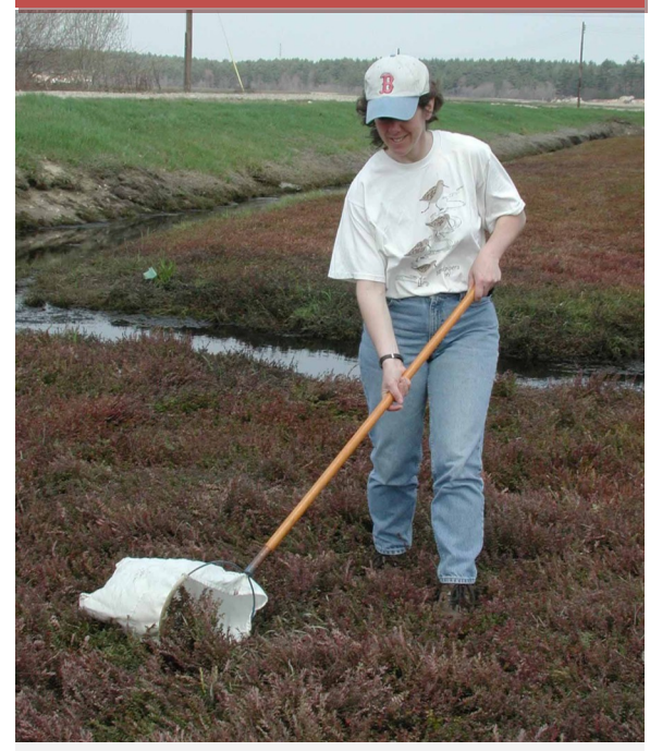
Use sweep netting to collect a sample of insects from your bog. After you use your sweep net, count the collected insects. Do you have too many pests?

Sweep Netting: A strong defense against insect pests.